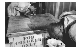
Segregation in the USA