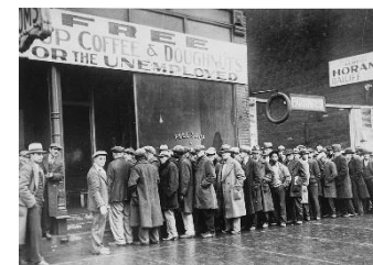
The Great Depression